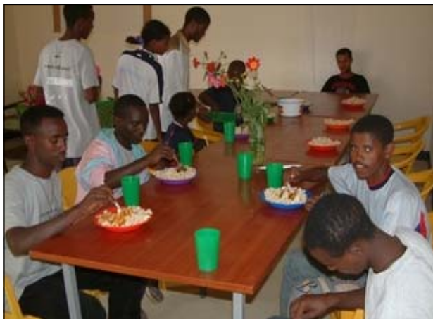
Mealtime: The children have two meals a day at the centre

Each day they receive two cooked meals and they are given the opportunity the wash their clothes and themselves, go on walks, play games and get